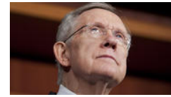
Senators protest sequester cuts