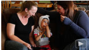
Video: Sisters open home to burned Afghan girl