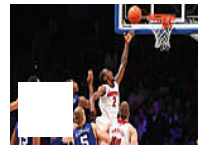
Louisville Overall Top Seed in N...