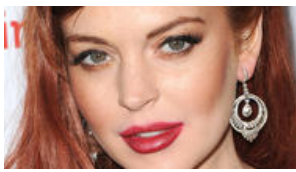
Lindsay Lohan: A not-guilty plea, but that's not all