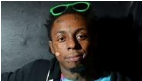
Photos: Rapper Lil Wayne a.k.a. Dwayne Carter