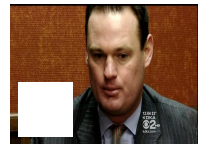
Mayor: Detective Should Be Fire...