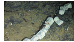
Whale skeleton turns up nine new species